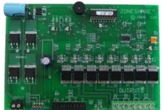
ZoneShare Model ZS4X

ZS4E..... ZoneShare Deluxe Mounted In Case ..... $179.95